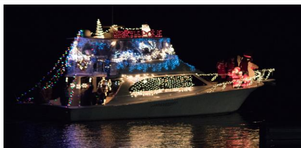
Best of Show---Terrie Womble's "Dirty Pool"

For all the Boat Parade of Lights results, go to www.carrabelle.org & scroll down